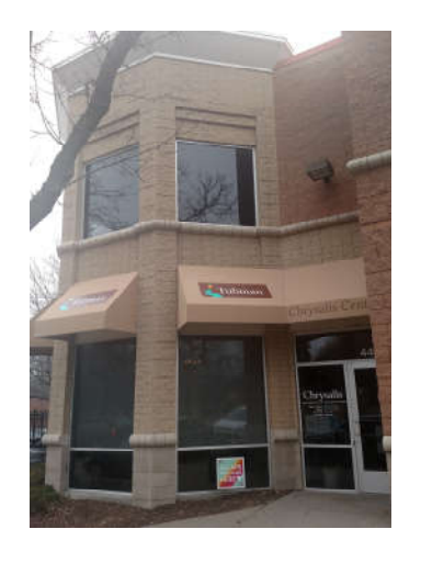
Tubman Chrysalis Center 4432 Chicago Avenue South Minneapolis MN 55407 M-TH 7:30 a.m. to 8 p.m. F 8:30 a.m. to 3 p.m.